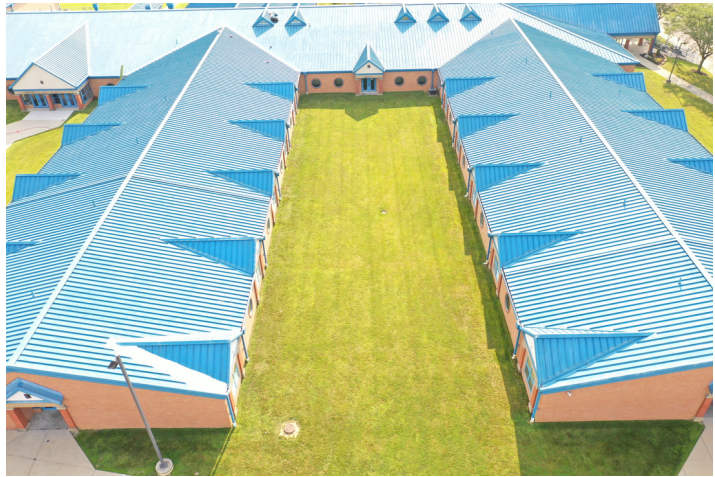
Location of planned outdoor learning complex on BPS west side

TAKING EDUCATION OUTSIDE SO OUR STUDENTS CAN LEARN EVERYWHERE