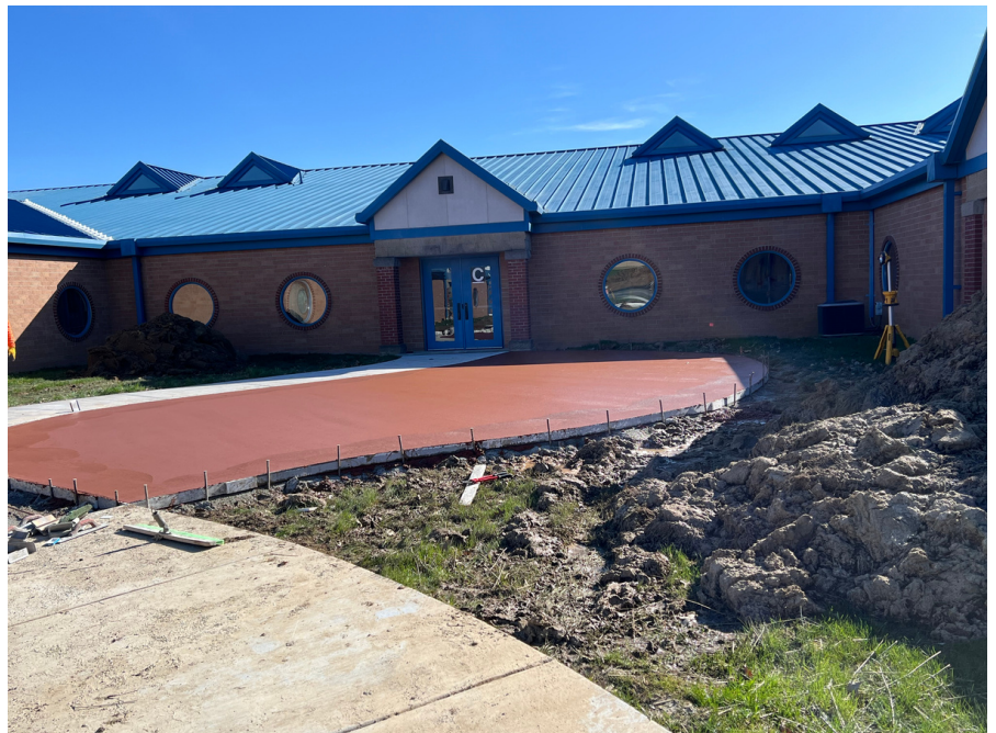
One of the outdoor patio spaces at BPS with colored concrete that was poured by Amberger Concrete during Spring Break.