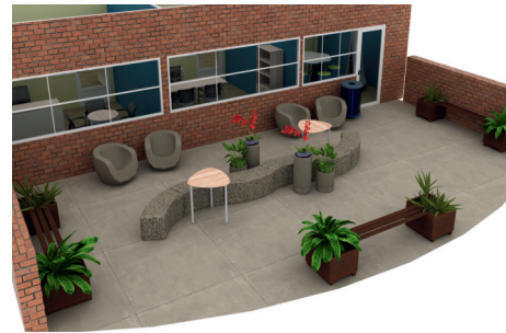
Outdoor patio area (enlarged view)

Overall conceptual plan provided by architectural firm Fanning Howey. Images included here provided by School Specialty to show suggested furnishings in the space.