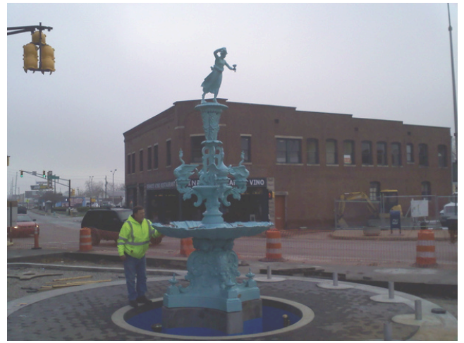
Tom checking out the installation process at Fountain Square in Indianapolis.