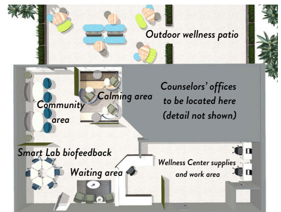
Revised floor plan for the new center, courtesy of possible furnishings vendor LOTH.

We are excited to bring this unique space to our students. The goal is still for the new space to be completed and ready for students at the beginning of the 2025-26 school year.